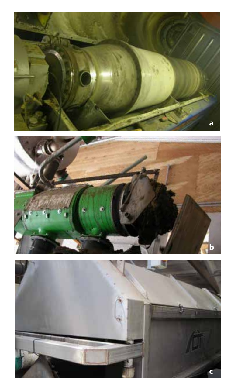
Figure 3. Separator types: a) Centrifuge, b) screw press, and c) rotating screen.

Installing a manure solid-liquid separator can reduce GHG and ammonia emissions during manure storage and after land application when compared to manure handling without processing. A separator reduces GHG emissions through multiple pathways. First, methane emissions from liquid manure storage are reduced since the compounds responsible for these emissions (volatile solids) are separated along with the solid stream (Aguirre-Villegas, Larson, and Reinemann 2014). Second, if manure solids are stored, the aerated conditions that exist during this storage limit the emissions of methane. Third, the separation process removes the fibrous and large pieces of organic material from the manure liquid fraction, which prevents a natural crust from forming on top of the stored liquid. A natural crust can create aerobic conditions that promote nitrate production near the surface. Nitrate can then be converted to nitrous oxide, a GHG that is 264 times more potent in warming the Earth than carbon dioxide (Rotz et al. 2015). Without a natural crust